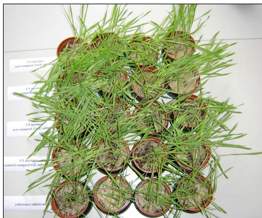
Figure 4. Overview of the summer barley plant growth at the end of the test (from bottom to top: reference substrate, control compost 1/1 mixture, Sample A compost 1/1 (see report MST-4/1a), Sample B compost 1/1 (see report MST-4/1b) and 1812/93224 compost 1/1).