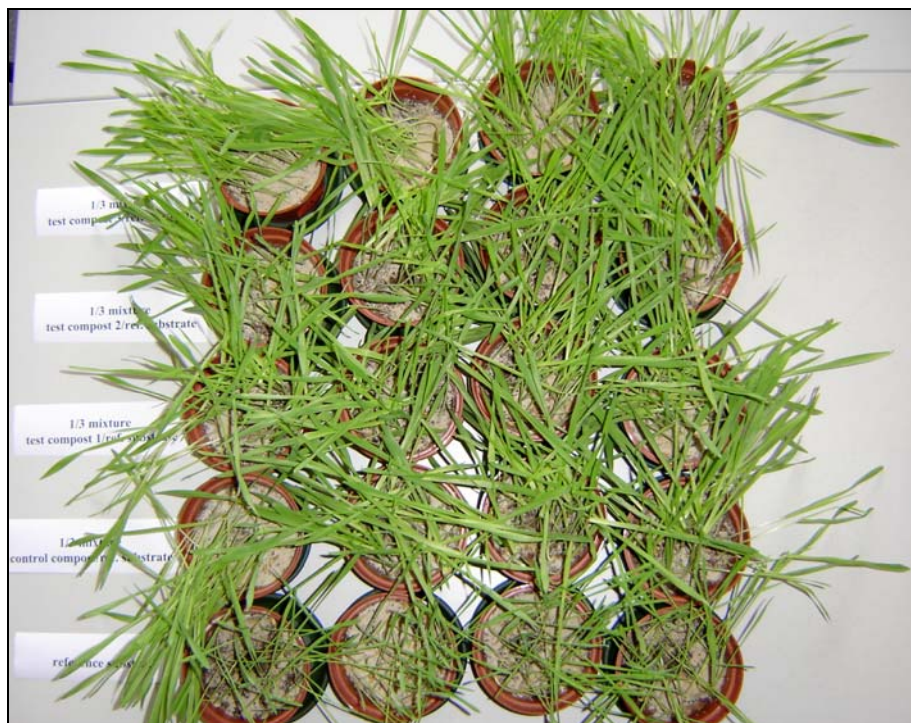
Figure 3. Overview of the summer barley plant growth at the end of the test (from bottom to top: reference substrate, control compost 1/3 mixture, Sample A compost 1/3 (see report MST-4/1a), Sample B compost 1/3 (see report MST-4/1b) and 1812/93224 compost 1/3).